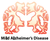
Mild Alzheimer's Disease